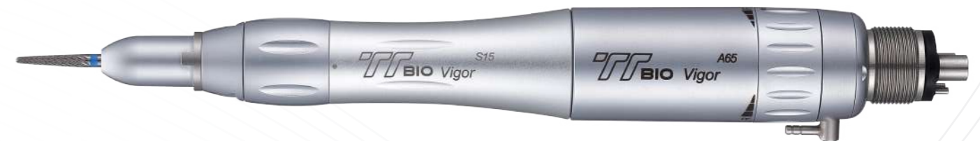
(Vigor A65 + Vigor S15 + Vigor C36) Air Motor Kit

External Type Single Spray Ample water mists with accurate spray angle.